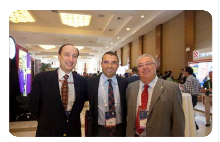
Appearance from the coffee break.