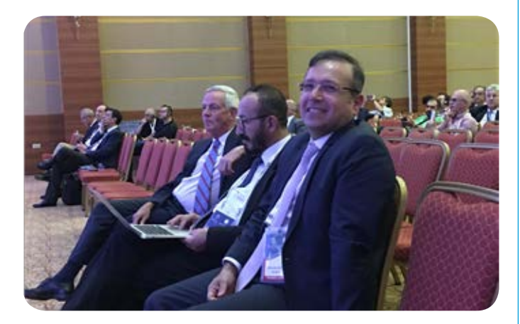
Appearance from the audience and meeting hall.